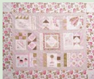
Antiques n Roses BOM lap quilt or wallhanging. $25 per month over 10 months. Contact Attic Quilts for details.