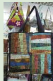
Bohemian Bali Sack bag by Common Thread Designs, pattern available from Missy-Moo Cottage Crafts. Contact Missy-Moo Cottage Crafts for details.